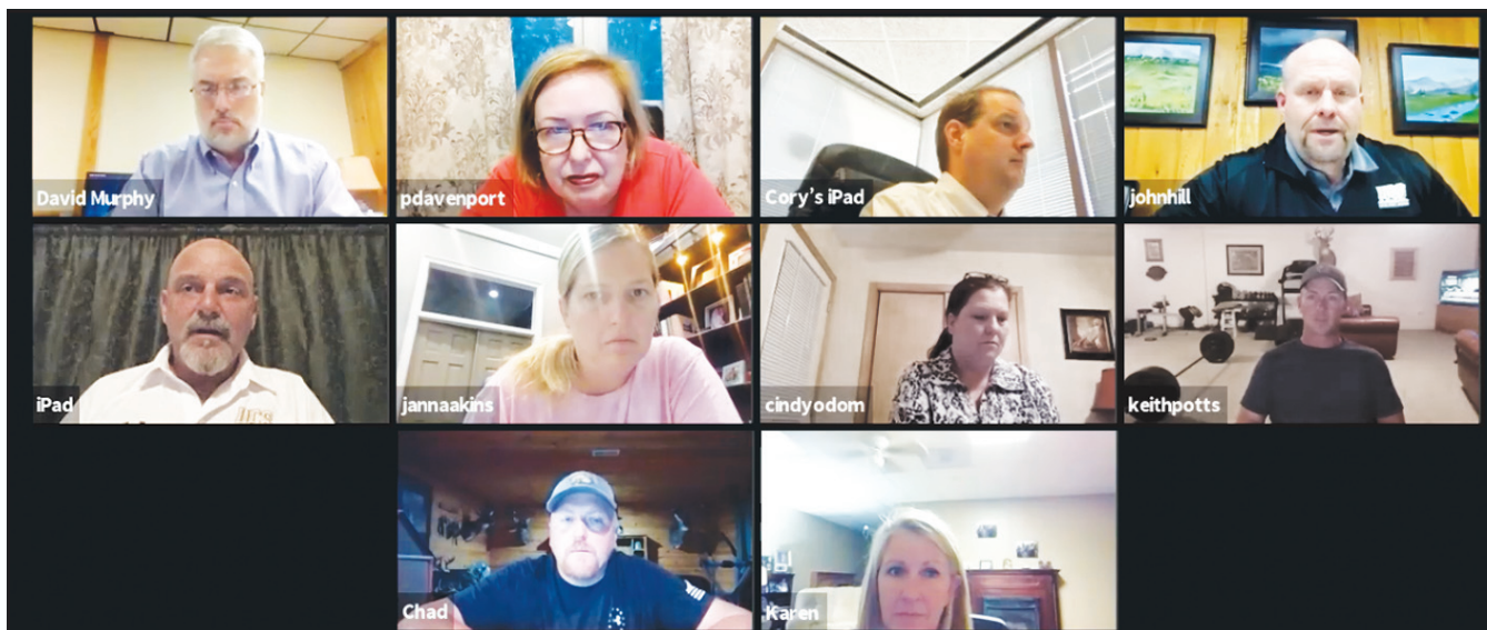
The Union County Board of Education held two called meetings over Zoom last week, in which they discussed graduation plans for UCHS and Wood Gap seniors. Photo/Screenshot